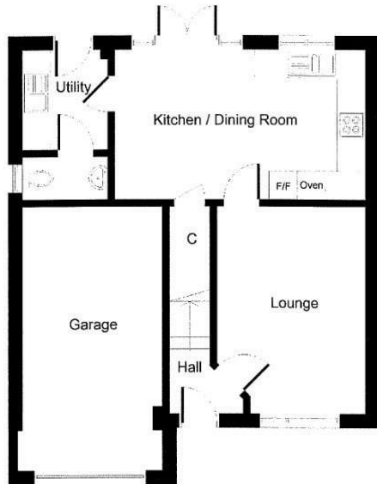
Ground Floor Approximate Floor Area (Including Garage) 608 Sq. ft. (56.48 Sq. m.)

We have every attempt to ensure the accuracy of the floor plan contained here. Measurements of doors, windows, rooms and any other items are approximate and no responsibility is taken for any error, omission, or misstatement. The measurements should not be relied upon for valuation, insurance or other financial purposes. This plan is for guidance purposes only and should be used as such by any prospective purchaser or tenant. The services, systems and appliances shown have not been tested and no guarantee as to their condition or efficiency can be given. Copyright V360 Ltd 2023 | www.houseviz.com